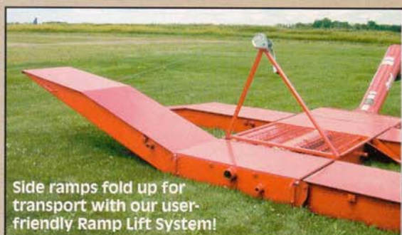
Side ramps fold up for transport with our user-friendly Ramp Lift System!

Side Hopper - 30" x 48" Center Hopper - 48" x 48" Discharge Ht. - 30" Tube Length - 6' Overall Ht., hopper body - 10-1/4" Ramps - 30" wide, 10' long Weight - 4000 lb.